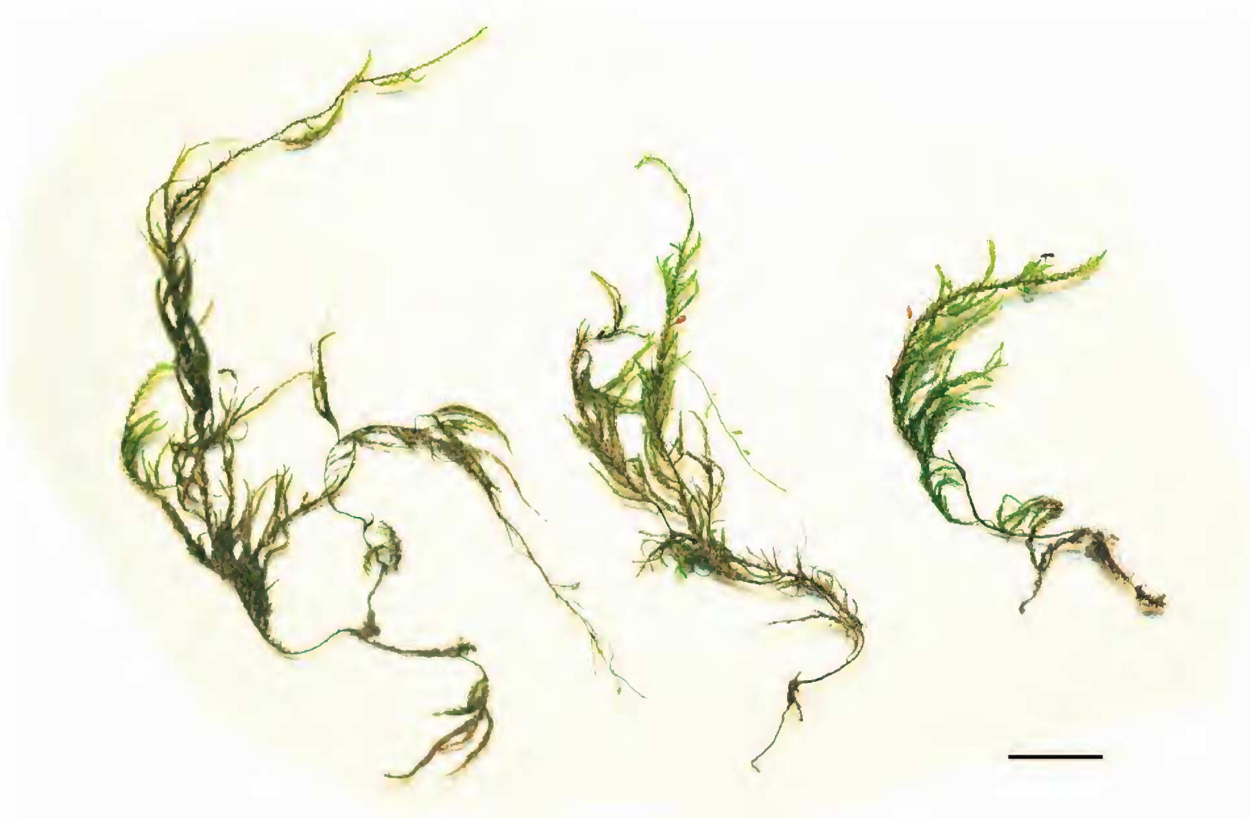
Fig. 3. Plants of Curvycladium kurzii with capsules. Scale bar = 1 cm. Image from W.Z. Ma 15-6298 (CAS).

Recognition: Curvycladium kurzii shares many morphological similarities with Pinnatella , such as the general branching pattern and the overall leaf shape, as well as the rectangular intra-marginal cells near the alar region. However, C. kurzii is easily distinguished from the latter by having arcuate branches that sometimes grow up to 10 cm long, as well as capsules borne on a long seta compared with exserted capsules in Pinnatella .